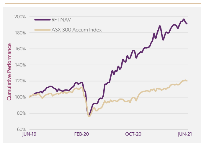
Past performance is not a reliable indicator of future performance. Net of fees and costs