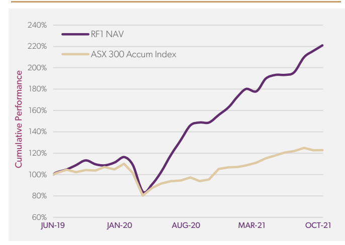
Chart represents cumulative performance of RF1 NAV since inception on 17 June 2019. Net offees and costs. Performance figures assume reinvestment of income. Past performance is not a reliable indicator of future performance.