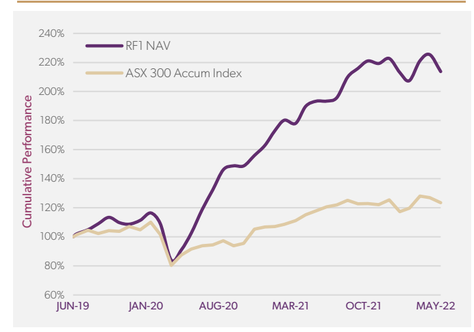
Chart represents cumulative performance of RF1 NAV since inception on 17 June 2019. Net of fees and costs. Performance figures assume reinvestment of income. Past performance is not a reliable indicator of future performance.