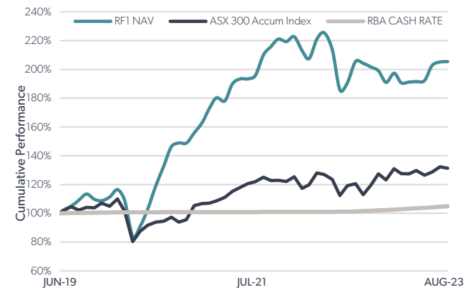
Chart represents cumulative performance of RF1 NAV since inception on 17 June 2019. Net of fees and costs. Performance figures assume reinvestment of income. Past performance is not a reliable indicator of future performance.