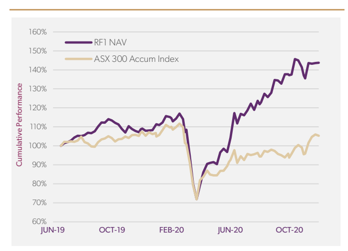
Past performance is not a reliable indicator of future performance.