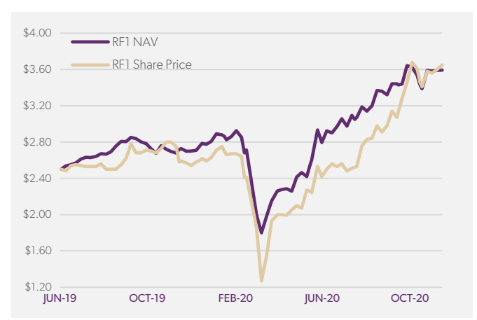
Past performance is not a reliable indicator of future performance.