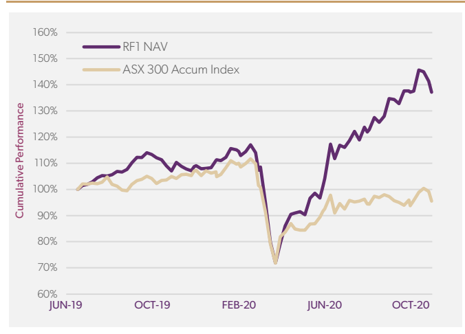
Past performance is not a reliable indicator of future performance.