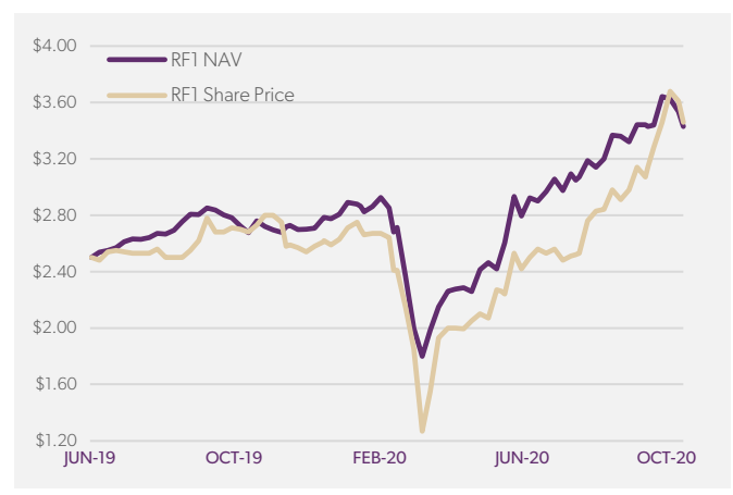
Past performance is not a reliable indicator of future performance.