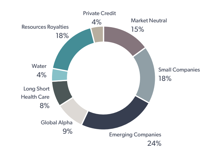
^2 As at 31 May 2023. The Fund portfolio will be constructed using multiple Regal Investment Strategies and these Strategies are not necessarily limited to the current Investment Strategies.